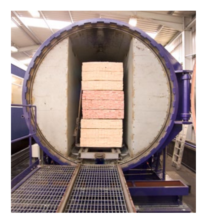
from the COPR to the Biocidal Products Regulations (as amended) 2001.

No person should use a biocide, including a wood preservative, in the workplace unless they have received adequate instruction, training and guidance in the safe and efficient use of biocides and is competent for the duties which they are called upon to perform, in accordance with the Control of Pesticides Regulations (COPR) 1986, as amended. Approvals for wood preservatives will progressively transfer